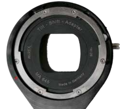
Mamiya to EOS Tilt Shift