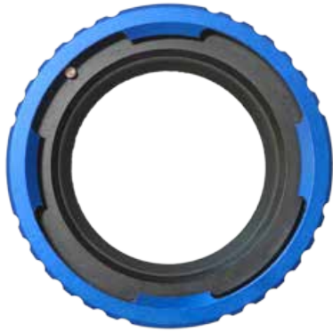
PL to EOS