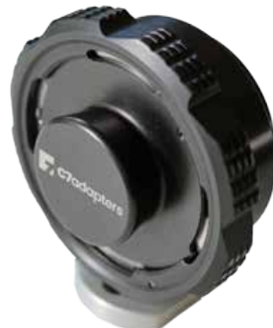
Fuji X to PL