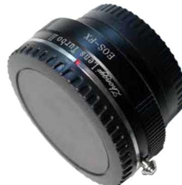
Fuji X to EOS focal reducer