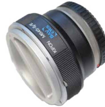
Mamiya to Sony E focal reducer