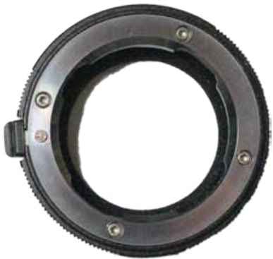
Fuji X to Leica M