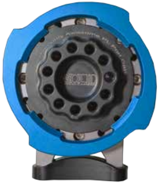
MFT to PL