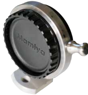
Mamiya to EOS